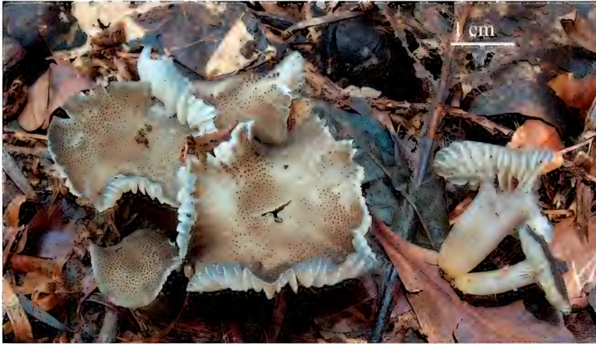
FIG. 1. Hygrocybe griseobrunnea (holotype). Basidiomata in situ.

with age, usually fissile, and with violet-grey to greyish violet (18B2-3, 18C2-3) tint at margin. LAMELLAE adnate to short-decurrent, waxy, transparent, thick, fragile, up to 3 mm broad, concolorous at edge, white or near so, sometimes inconspicuously yellowish white (4A2 to 5A2), partially violet-white (18A2) especially near the pileus margin, with about 4 complete lamellae per cm, and usually with 1-3 lamellulae of different lengths between two complete lamellae. STIPE 12-28 × 3-6.5 mm (the length often shorter than the pileus diameter), central, hollow, terete or more often compressed terete, usually with a narrower base, in large fruitbodies irregularly furrowed, smooth, occasionally curved at base, white to pale violet or violet-grey to greyish violet (18A1-3, 18B2-3), becoming brownish orange to light brown (6C3, 6D4) at lower part when mature. CONTEXT thin, concolorous with the lamellae, fragile. SMELL insignificant.